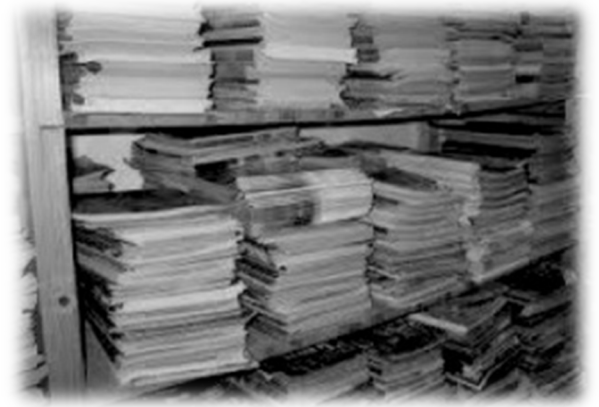
A familiar sight... unsold programmes

that only 20% of your crowd is bothering to buy. "I just look at the website, it doesn't cost anything," is a comment you often hear when a fan is asked if they buy a programme. And it's a trend that has gathered momentum.